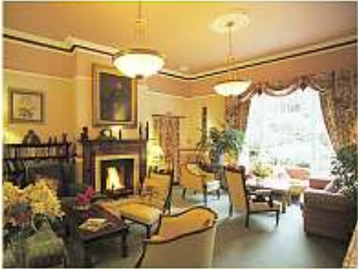
Log Fires in Winter

A stroll around the rhododendrons, or just over the border into Wales, might be your idea of the perfect pre-prandial activity. But there are few better places to tuck into tea and cake than on the hotel's terrace. It catches the full force of the afternoon sun, and on fine days you'll find all our guests out there soaking up the heady rural atmosphere.