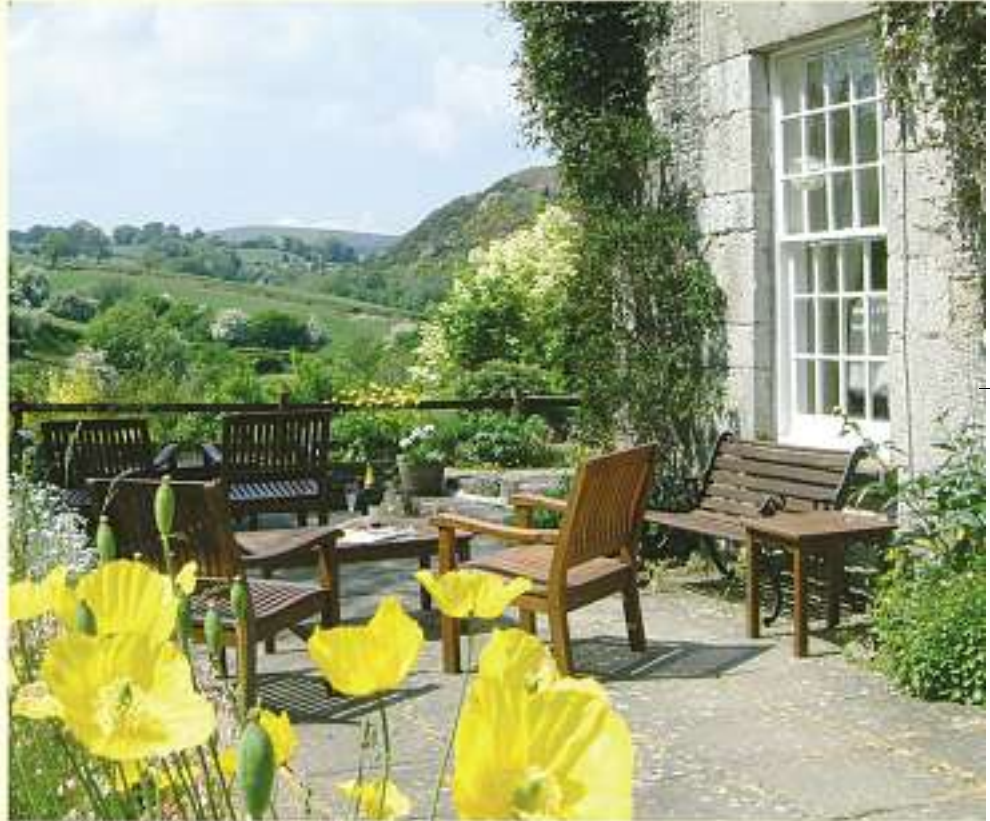
Tea on the Terrace

Peaceful Quality Retreat Calm Beautiful Scenery Tranquil Health Stylish Relaxation