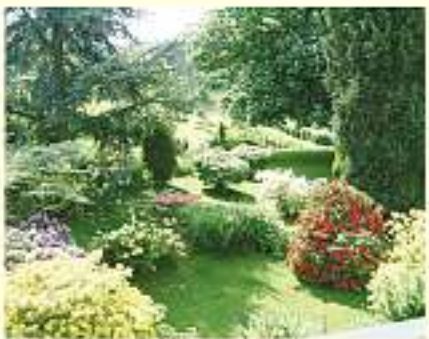
Gardens from a bedroom window

In a stunning location on the last hill in Shropshire, only a hundred yards from the Welsh border, this former Georgian Rectory is now a stylish country house hotel.