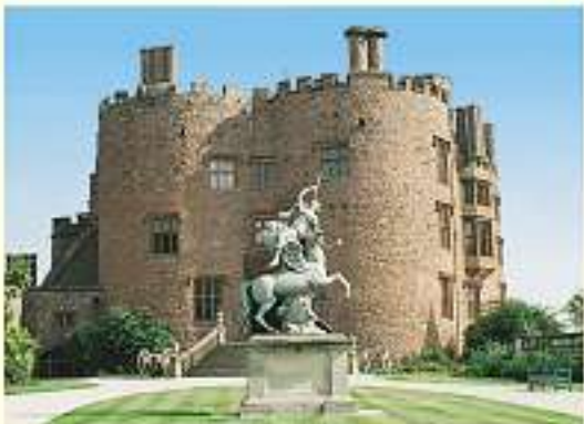
Powis Castle (National Trust)

Although blessed with an overwhelming sense of peace and serenity, you're never far from civilisation at Pen-y-Dyffryn. This Borderland countryside positively breathes history and there are four major National Trust properties nearby; Powis Castle, Chirk Castle, Attingham Hall and Erddig. The medieval timbered towns of Chester and Shrewsbury are only thirty minutes drive and each merits a day's visit in itself. The small and friendly town of Oswestry is three miles away, hosting the biggest street market in Shropshire on a Wednesday.