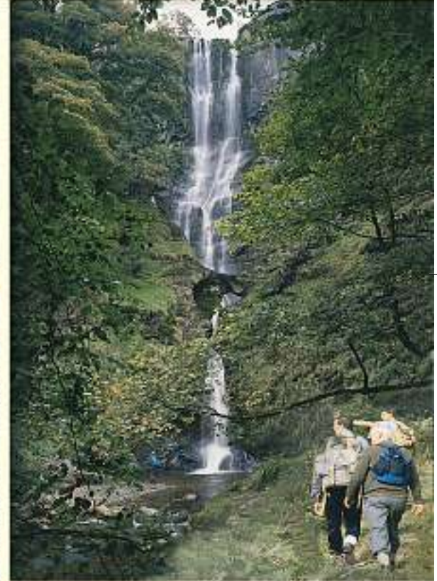
Pistyll Rhaeadr waterfall

Peaceful Quality Retreat Calm Beautiful Scenery Tranquil Health Stylish Relaxation