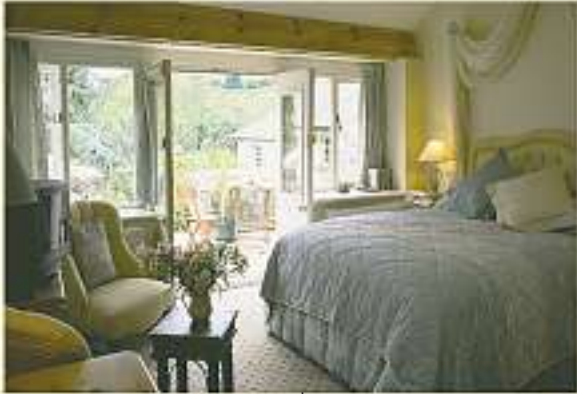
Room with a View