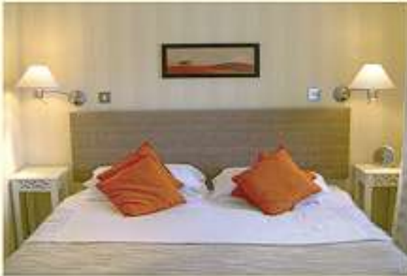
Comfort and Style